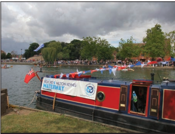
Ken and Sue Deveson's boat 'Cleddau'

Our team of volunteers recruited 22 new members and collected £166.40