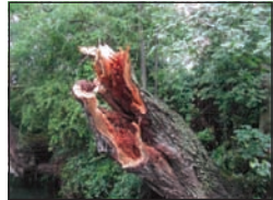
The offending stump

So a thousand 'thank yous' to EA. They really pulled the stops out to make sure we got through.