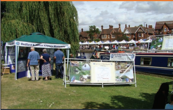
Our waterfront stand

One of the highlights of the summer was the chance to show the flag to the residents of Bedford and beyond.