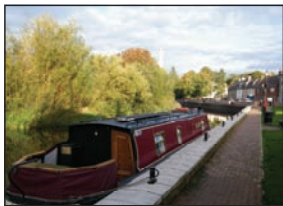
Moored at St Ives