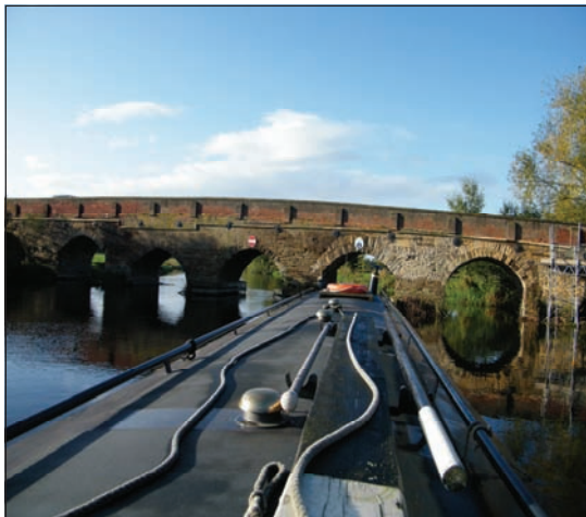
Great Barford Bridge