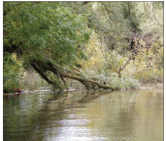
Premature Limit Of Navigation